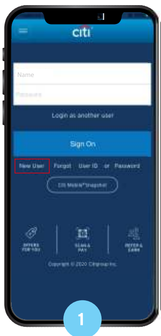
Click on 'New User'