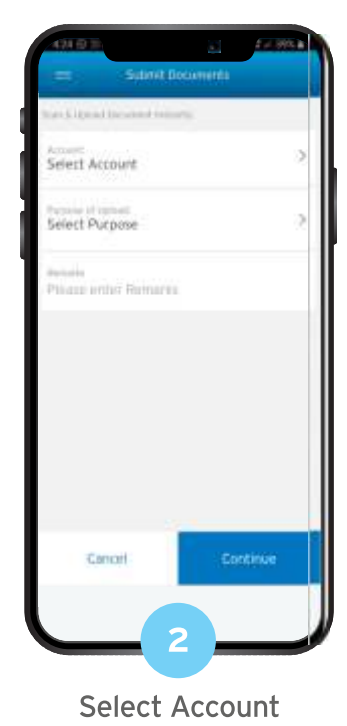
> Select Account > Select Purpose > Continue